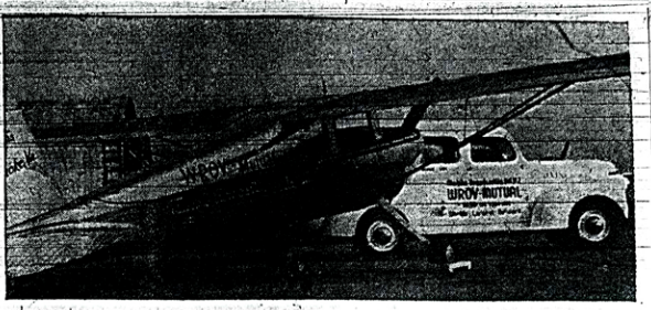
ON-THE-SPOT NEWS COVERAGE EQUIPMENT —Shown above are the mobile and airborne units of station WROV which will be used to cover news and special events from the scene. As soon as equipment can be assembled the units will be put into use in remote broadcasts on major events. A short wave transmitter, recording machinery and portable wire recorder will be placed in the plane, a new Cessna that is operated for WROV by the Woodrum Flying Service.

The three best tips of the week will earn cash prizes of five dollars each and tickets to local theaters to be given on other newsworthy tips. So if you know of exclusive news, or news-crash accidents, fires, when they happen, or any special news, call WROV at 3-4444 and ask for the news tip editor.